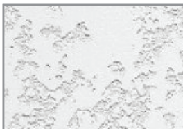
Spatter / Knockdown